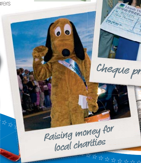
Raising money for local charities