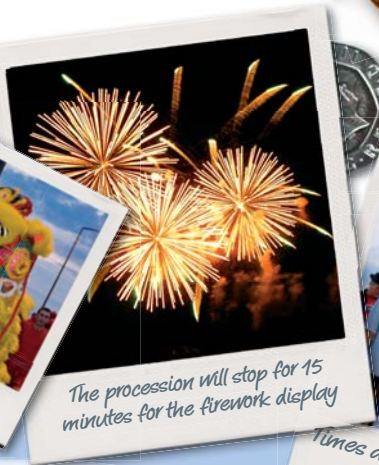
The procession will stop for 15 minutes for the firework display

for full details visit www.southendcarnival.org.uk