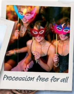
Procession free for all