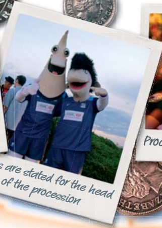
Times are stated for the head of the procession