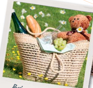
Bring a picnic