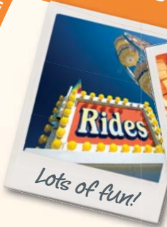
Lots of fun!