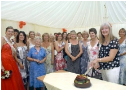
A host of former Cromer Carnival queens gather two years ago.

Entrants must be 17 years old or over and live within the area of the Poppyland Partnership - Cromer, Suffield Park, Aldborough, Aylmerton, East and West Runton, Felbrigg, Hanworth, Northrepps, Overstrand, Roughton, Sidestrand, Sustead and Trimmingham.