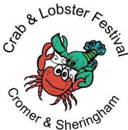
Figures 4 & 5: Sheringham and Cromer have used images of what you might find at their carnivals http://demo.sheringhamcarnival.com/ http://www.cromercarnival.co.uk/