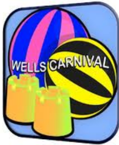
Figure 1: Wells include symbols of their seaside location in their logo http://www.wellscarnival.co.uk/