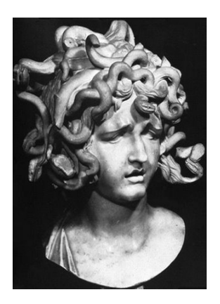
Bernini - Medusa