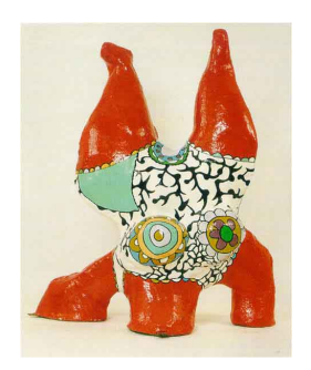
Niki de Saint Phalle